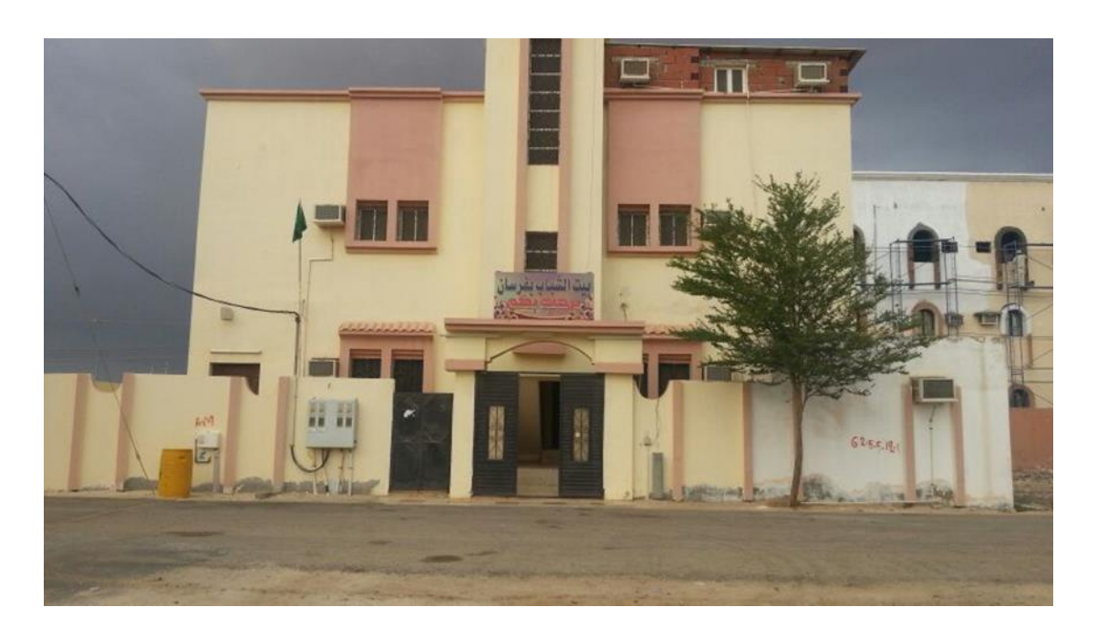
Building from the outside