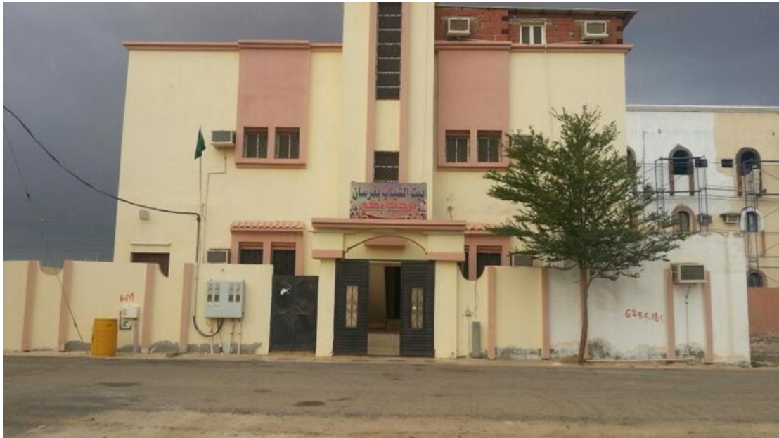
Building from the outside